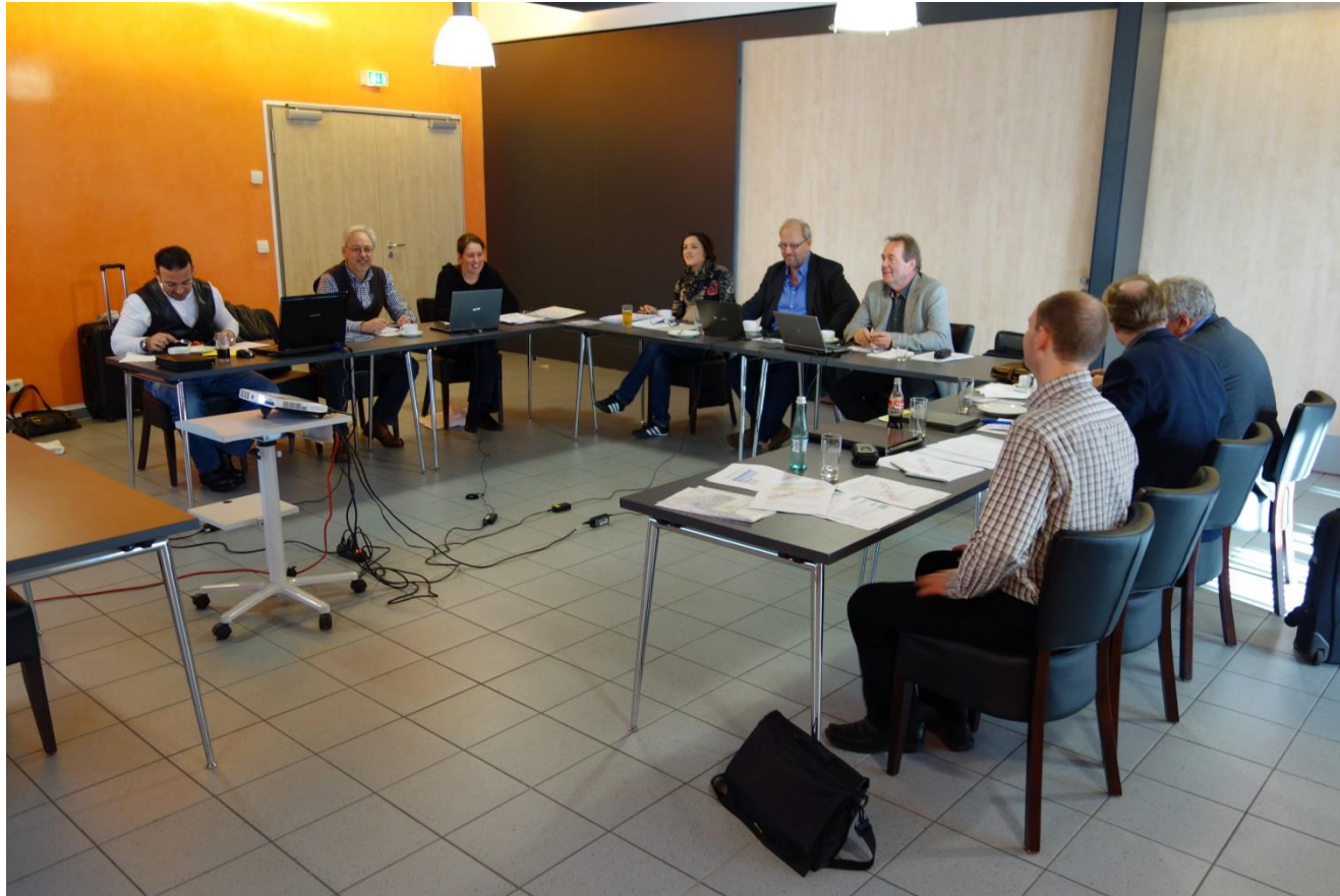
Expert Meeting Cologne, 2014