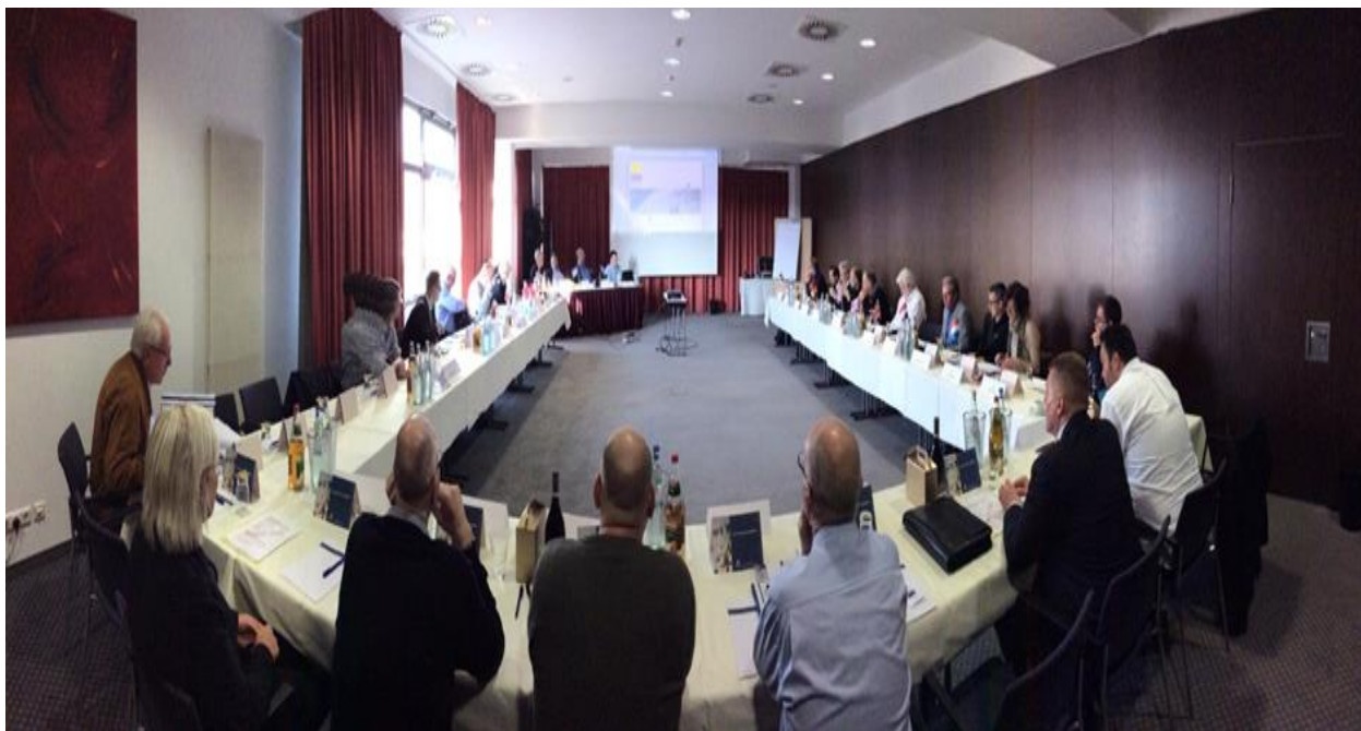
General Assembly, Trier, 2014