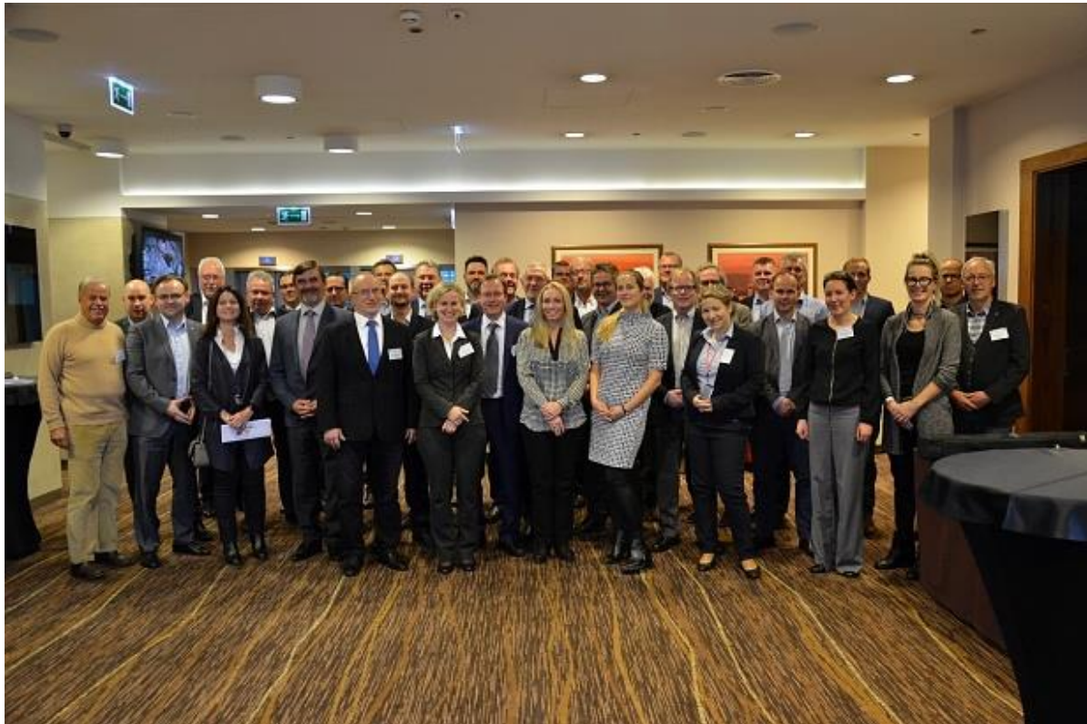
General Assembly, Krakow, 2016