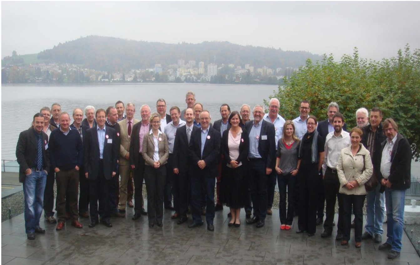
General Assembly, Lucerne, 2012