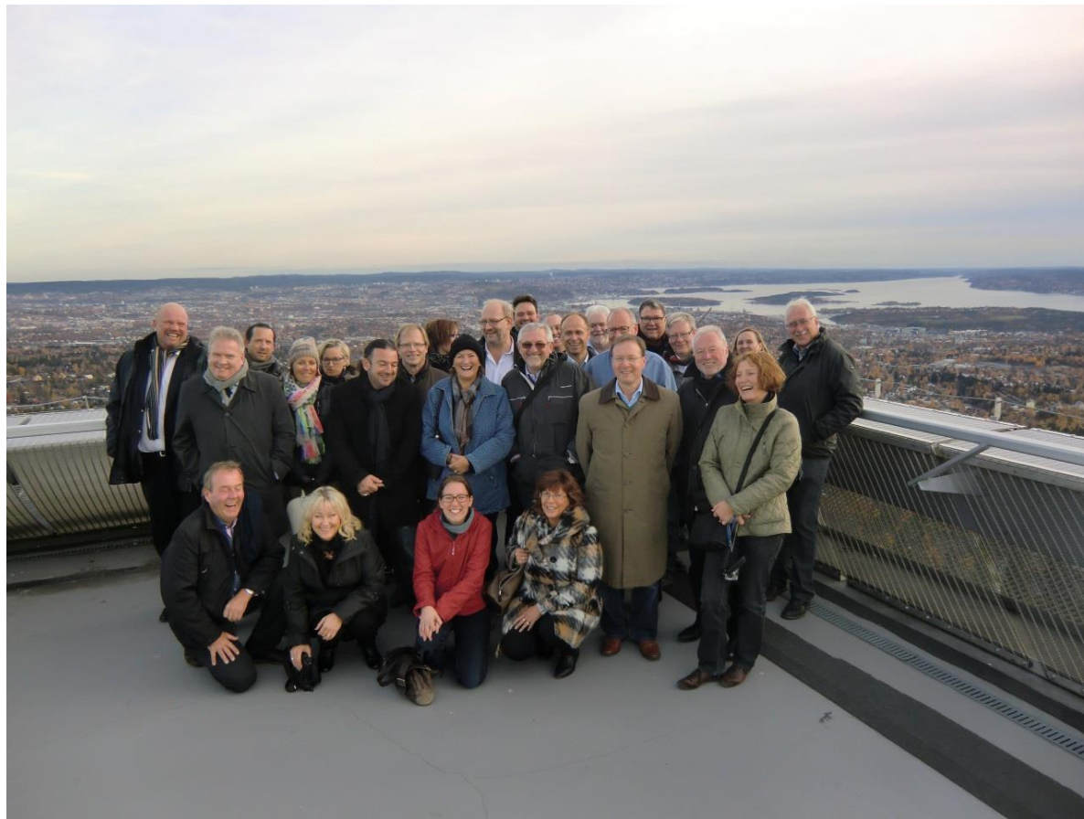
General Assembly in Oslo, October 2013