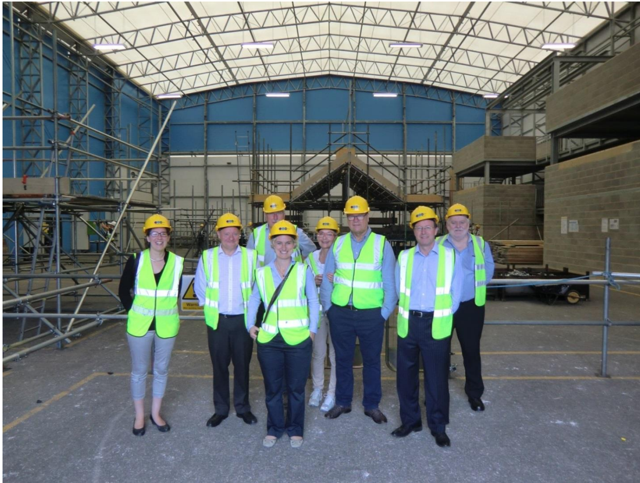
Training Center London 2014