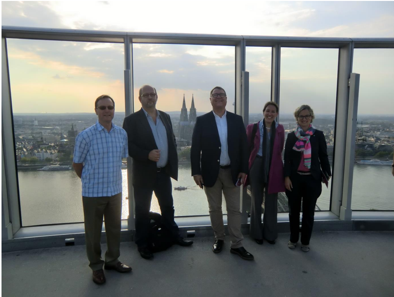
Chair in Cologne, 2013