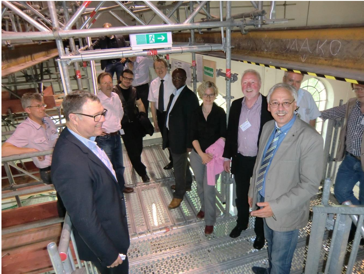
Training Center Dortmund, 2013